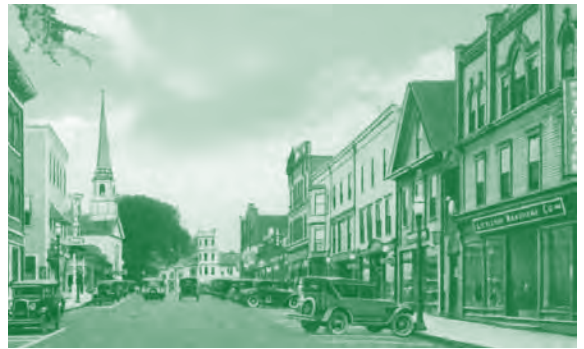
Main Street in the late 1930s, looking east. The Brackett Block is at right.

On the northern corner of Mill Street is Main Street's oldest commercial building, THE BRACKETT BLOCK (13) (In local usage the word "block" may refer to a single building rather than individual properties between two streets). Named for the Brackett brothers, William (1785–1859) and Aaron B. (1797–1868). Traders in general merchandise, they constructed the block in 1833 of timber harvested in the village and shaped by an Ammonoosuc River sawyer. The street level resembles its original aspect. The third floor was