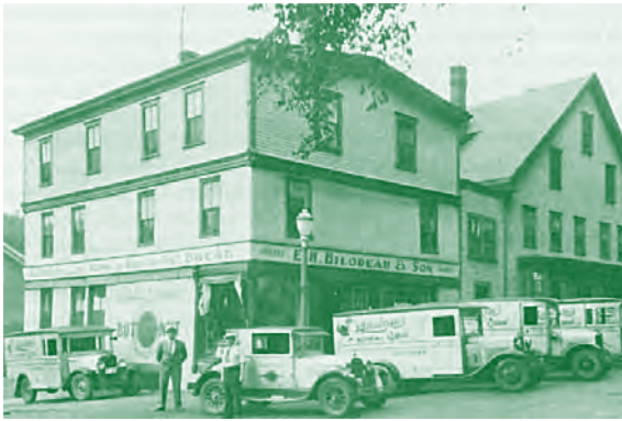
Bilodeau's Bakery in the 1930s.

In the 1930s, to grab the attention of motorists, a new, eye-catching architecture evolved, exemplified by the “diner car” restaurant. A 25-seat “parlor car” appeared on the site of THE LITTLETON DINER (2) in 1930, to be replaced in 1940 by this Sterling Diner, a stainless steel classic manufactured by the J.B. Judkins Company of Merrimac, MA.