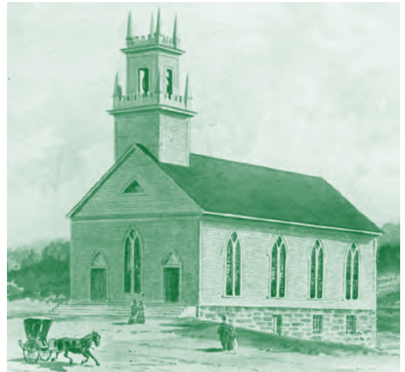
The original First Congregational Church, erected in 1832.

W hite settlers traveled up the Connecticut River and established two hamlets in the township on the Connecticut and Ammonoosuc Rivers where Native Americans had occupied seasonal fishing camps. Ammonoosuc means “narrow fishing river” in the Native American Abenaki language. The first meetinghouse (1815) was erected midway between the two settlements. (A plaque near Partridge Lake marks the site.) Because the Connecticut River was too broad and turbulent for primitive mills, settlers migrated to “Ammonoosuc Village,” where, in 1832, they built the FIRST CONGREGATIONAL CHURCH (1) on “Meetinghouse Hill.” They called the stormy Reverend Drury Fairbank (1772–1853) to the pulpit. During his pastorate, the church was irreverently