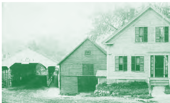
The covered bridge (at left) on the site of today's Veterans' Memorial Bridge. The sign warns of a $2.00 fine for galloping horses.

To complete your tour, walk across the VETERANS' MEMORIAL BRIDGE (24) . The first "Cottage Street Bridge" was erected here in 1810, and a covered bridge spanned the river from 1839 to 1894. By an act of the NH Senate, the present bridge was designated the Cottage Street Veterans' Memorial Bridge and dedicated on Memorial Day of 2003. It displays 47 plaques honoring Littleton veterans killed in action in America's wars from the Civil War to Operation Iraqi Freedom. Two other plaques recognize a Medal of Honor winner and 16 Littleton soldiers who perished from disease or other causes during the Civil War and World War I. The bridge—recognizing individual veterans from a single town—is purported to be the only of its kind in the nation. The Littleton VFW maintains