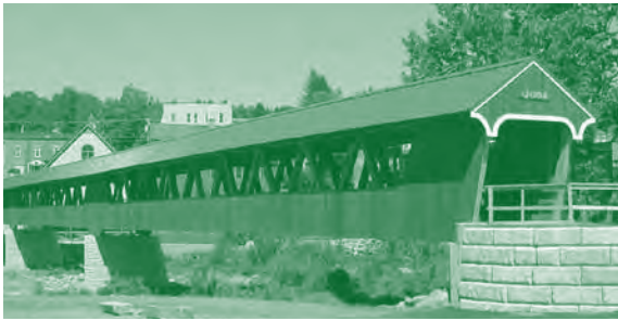
The state's newest covered bridge, the Riverwalk Covered Bridge, recalls the town's classic 19th century spans.

IN LITTLETON, THE PAST IS PROLOGUE, and Main Street proves that this town's future is shaped by a rich heritage. As the Littleton Chamber of Commerce observed in 1921: