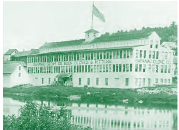
Saranac Glove Co., circa 1900.