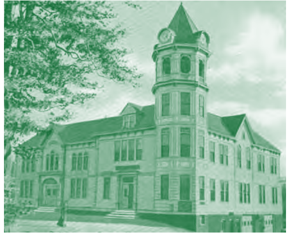
The Town Building circa 1896.

windows. A flag-topped dome originally crowned the rounded corner, and the building housed the Star Theater, the town's first movie theater. Guted by fire in 1917, the block was rebuilt, with the same façade.