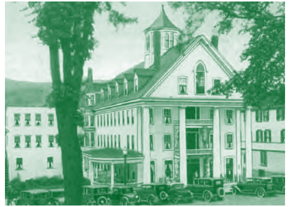
Thayers Inn in the 1930s.