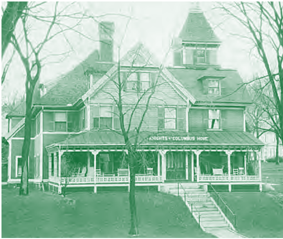
The Parker Mansion in the 1920s.