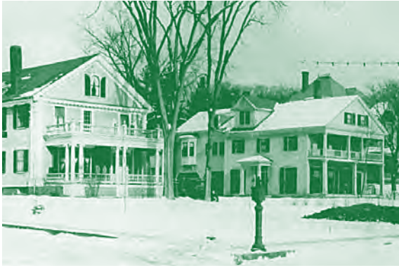
The grand residences of Doctors Beattie and Moffet stood at the corner of Main and Maple Streets, now site of the Post Office and Courthouse.

the architect to evolve a handsome exterior reflecting a century of Main Street motifs. The cost of construction was $265,000.