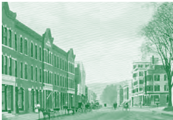
Main Street looking west in 1909.