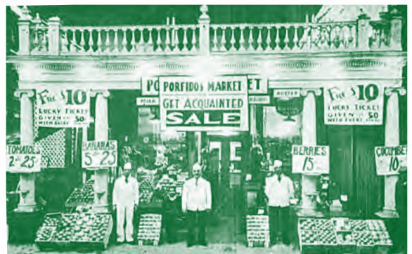
Porfido's Market, circa 1935.

Porter and oversees the use of Pollyanna of Littleton as a public attraction, cultural asset, resource, and positive inspiration for the community and others.” This sculpture was recognized as the state’s “Best Public Art” by New Hampshire Magazine in 2002. Few visitors can resist posing near the statue and imitating Pollyanna’s exuberant gesture for a keepsake photo. The Town fathers proclaimed for perpetuity the second Saturday in June as Pollyanna Day, a day of ceremonies that celebrate “gladness”.