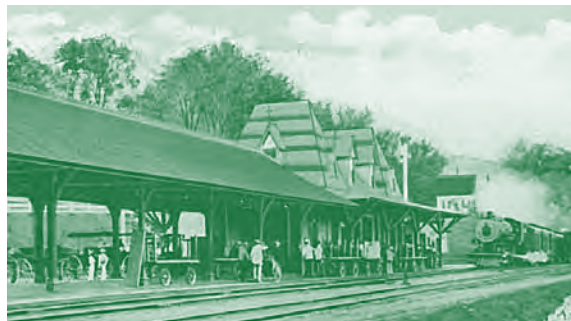
Littleton's Boston & Maine railroad station, circa 1900.

the memorial, which was funded by hundreds of individuals and businesses. Upstream may be glimpsed factory structures—the descendants of the 19th century "Scythe Factory Village." Downstream are the Littleton Grist Mill and Riverwalk Covered Bridge .