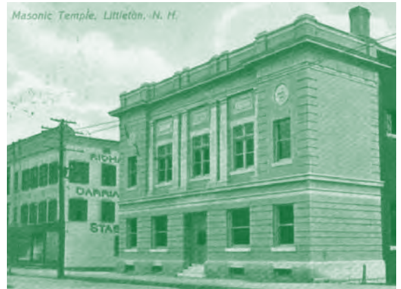
The Masonic Temple in 1911.

The diner’s neighbor to the east is the 1909 MASONIC TEMPLE (3) , the street’s sole example of Beaux Arts Classicism. Anti-Masonic sentiment delayed the establishment of a Lodge in Littleton until 1859. The Lodge was named for Dr. William Burns (1783–1868), the town’s second practicing physician. In 1865, members of the Burns Lodge built the Union Block, which stood between today’s Harrington and Chutter Blocks. They erected the present edifice on the site of the Union House, the village’s first (1826) tavern. It was financed by subscription and owned by a private society separate from the Lodge. The building’s disciplined symmetry was echoed years later in the design of the Public Library and the U.S. Post Office.