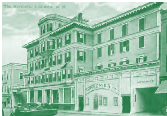
The Eames Block circa 1920s.