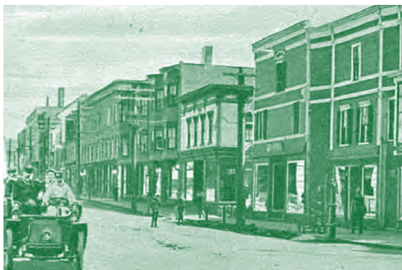
The Bugbee Block (center), circa 1910.

1898 Extract from a letter written by a visitor. —Picturesque and Progressive Littleton and the White Mountains