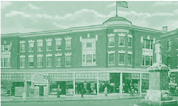
The Salomon Block circa 1917. The Civil War monument was moved to the Glenwood Cemetery in the 1950s.

The spire on the METHODIST CHURCH (21) was the first of Littleton's many spires. (The steeple on the earlier Congregational Church had a flat roof.) Built on the site of a tavern, the church with Doric columns on its Greek Revival portico was dedicated on January 8, 1851. In the 1880s, the Methodists renovated most of their churches by jacking up the sanctuaries and putting in ground-level meeting halls. This happened here in 1888, when a pilastered façade and Palladian window replaced the original portico. The Methodists had been meeting in Littleton since 1800, but this was their first permanent home.