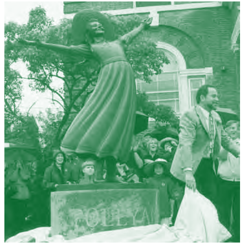
The unveiling of the Pollyanna sculpture in June, 2002.