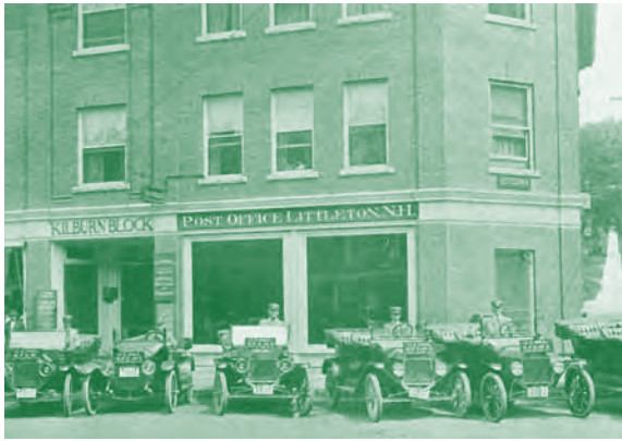
The Kilburn Block with postal delivery vehicles in 1920.

keen appreciation for visual detail is no doubt responsible for the building's "modillions"—ornamental brackets under the corona of the cornice—and other tasteful design elements. It housed the Post Office until 1935.