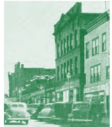
The Chutter Block, second from right, in the 1940s.