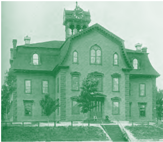
Littleton High School, circa 1930.

After four attempts over nearly a century, a permanent public library was established in 1890. From rented quarters in the ROUNSEVEL BUILDING (#17) , it moved to the new Town Building in 1895, and then in 1906 to the present LITTLETON PUBLIC LIBRARY (8) , a Carnegie bequest. To meet Andrew Carnegie’s conditions, the Town pledged $1,500 per year for operations and secured land for the building. Carnegie bequeathed $15,000 for construction, which was completed in 1906. The library houses the Kilburn collection of White Mountain art and the world’s second largest collection of Kilburn stereoscopic views. Visually, the building presents an eclectic blend of Georgian and neo-classical styles—decorations of a richness ambitious for a structure of moderate size.